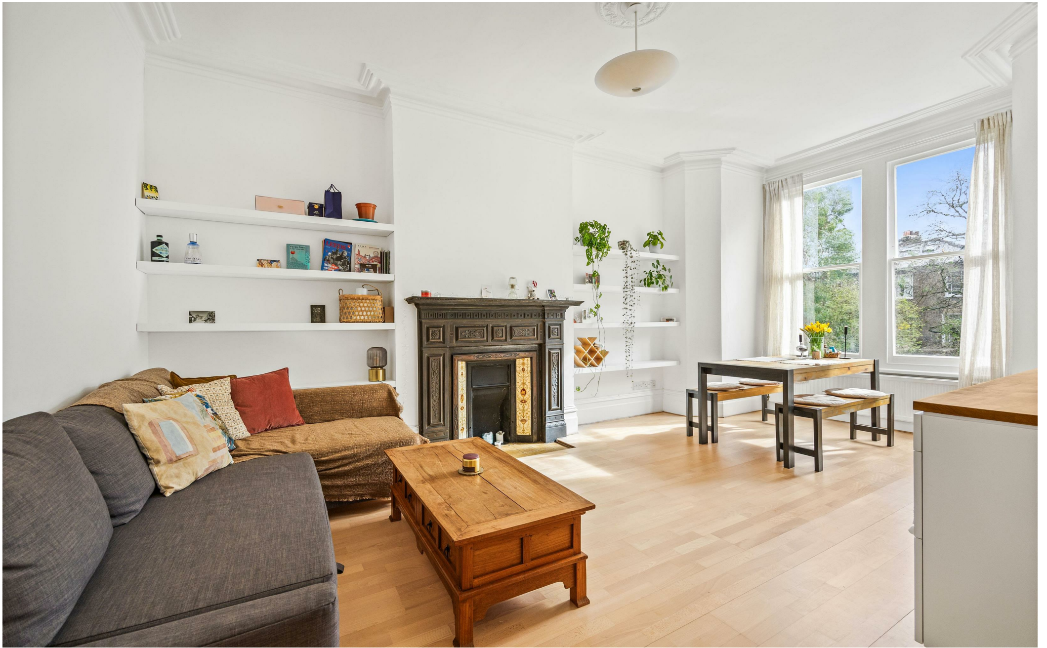
Goldhurst Terrace NW6